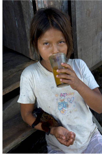
Figura 4 - Girl with pet saddle-back tamarin ( Saguinus fuscicollis ) drinking aguajina. Miraflores, Rio Tigre, Loreto, Peru 04-26-2006.

Of the 148 edible fruits documented for Pacaya-Samiria, only 12 are exotic (such as mango, breadfruit, and banana). The remaining are native to