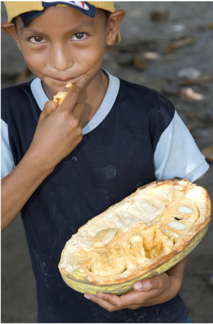
Figura 6 - Boy eating pulp of macambo ( Theobroma bicolor ). Manco Capac, Rio Pui-nahua (a branch of the Ucayali River), Loreto, Peru 04-14-2006.

The western part of the Amazon appears to be especially rich in edible fruits, in part because of increased rainfall and rising landforms in the foothills in the Amazon. Furthermore, wetlands in western Amazonia contain more edible species of fruits than uplands, which is counter-intuitive in that upland forests are thought to contain more species of plants and animals than floodplains because the latter are less than instead of that stable and subject to periodic inundations. With respect to fruits, at least, the highly dynamic floodplains of the Peruvian Amazon are a veritable treasure trove of potential new economic plants.