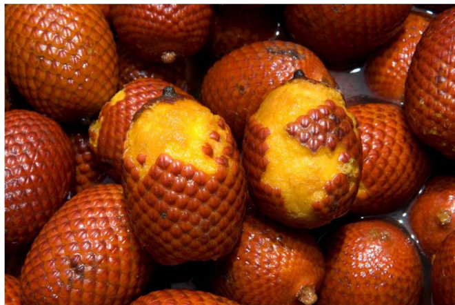
Figura 2 - Fruits of aguaje palm, known as buriti or miriti in Brazil, soaking in a bowl of water. After soaking, the fruits are either eaten or made into juice, called aguajina in Peru. Miraflores, Rio Tigre, Loreto Peru, 04-26-2006.