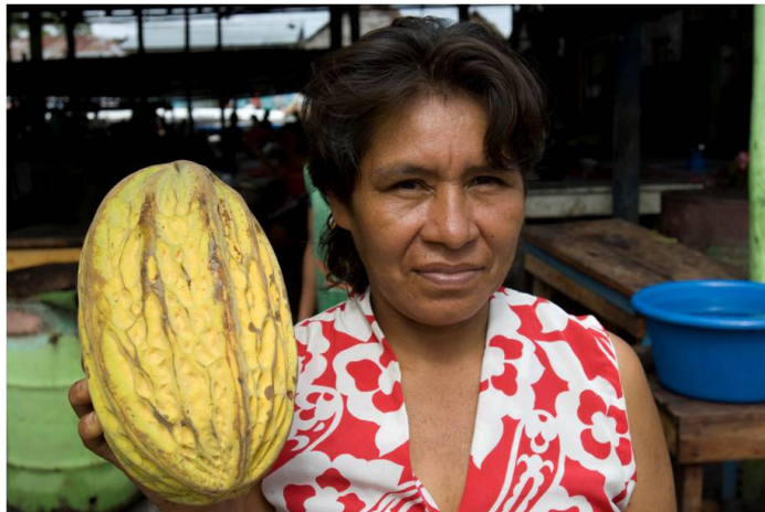
Figura 5 - Macambo ( Theobroma bicolor ) in a street market. The pulp of this near relative of cacao is eaten fresh while the seeds are roasted. Puerto Nanay, Iquitos, Peru 04-13-2006.

Some of the wild fruits in Pacaya-Samiria are also cultivated in home gardens ( huertas ) and fields ( chacras ). At least twenty fruit trees encountered in forests, including caimito ( Pouteria caimito ), genipap ( Genipa americana ) and macambo ( Theobroma bicolor ), are also planted in home gardens and/or fields (Appendix 2). Locals are thus recruiting new crops, some of which may eventually be planted on a wider scale. About one-fifth of the edible wild fruits gathered in forests have been incorporated in a wide assortment of agroforestry configurations assembled by local farmers. Most of the wild fruits are as yet little known outside of Amazonia. Conservation of floodplain forests is thus important on two accounts: as sources of new crops, and as gene pools of some existing crops.