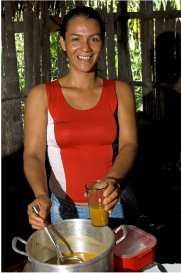
Figura 3 - Aguajina, juice of aguaje palm fruits, a nutritious beverage popular in the Peruvian Amazon and in the Amazon estuary. Miraflores, Rio Tigre, Loreto, Peru, 04-26-2006.

is also a significant reservoir of genes for upgrading some existing crops. The fruits of wild cacao ( Theobroma cacao ), for example, are gathered in forests as a snack throughout the reserve. Cacao is an important plantation crop in dozens of tropical countries and yields are periodically threatened by emerging diseases and pests. Sources of resistance to such attacks have sometimes been found in wild populations of cacao, but much remains to be learned about the desirable genes in wild stands of cacao. A lot is at stake here considering that the chocolate is a $10 billion global industry.