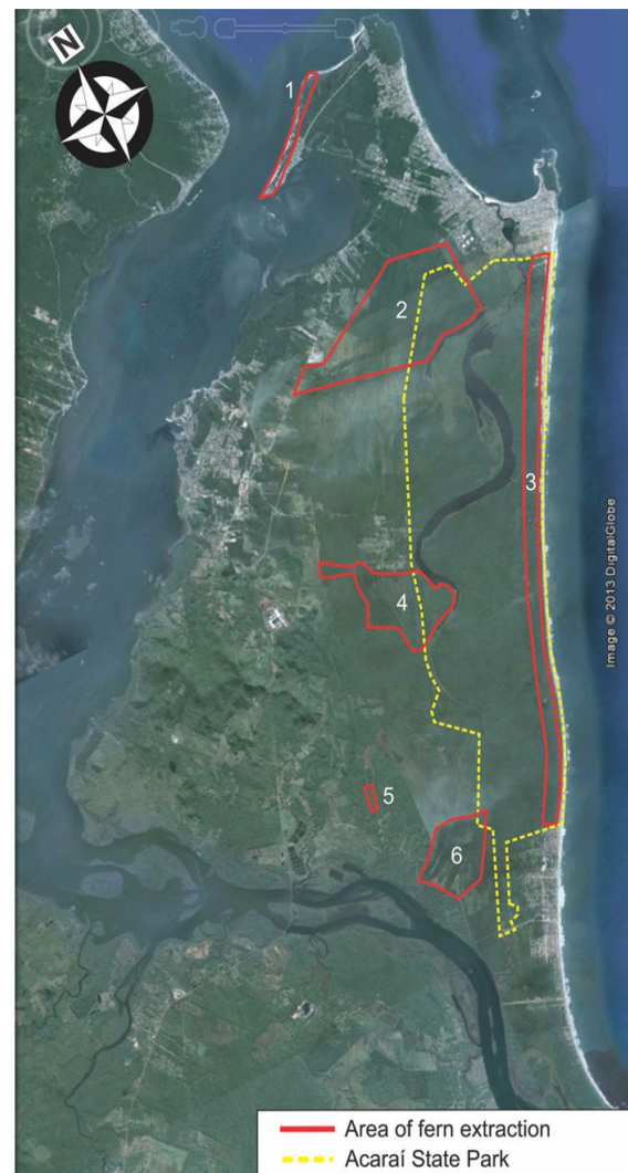
Figure 2: Synthesis of the participatory mappings for areas of fern harvest (red lines) and the delimitation of Acaraí State Park (yellow dotted line), São Francisco do Sul, Brazil. 1) Capri (swampy mangrove); 2) malha do capeta (or devil's mesh); leirinha (or small mount), sapatão (or big shoe) and casqueirinho (no translation); 3) sandbank accompanying road linking Ervino to Praia Grande; 4, 5 and 6) reforestation areas with Pinus sp. and Eucalyptus sp.

Areas with reforestation with Pinus sp. and Eucalyptus sp. (Figure 2, areas 4, 5 and 6) were indicated as areas accessed in very sunny days, because of the shadow in the understory. The drawback concerns the lower quality of the leaves, when compared with 'sun leaves'.