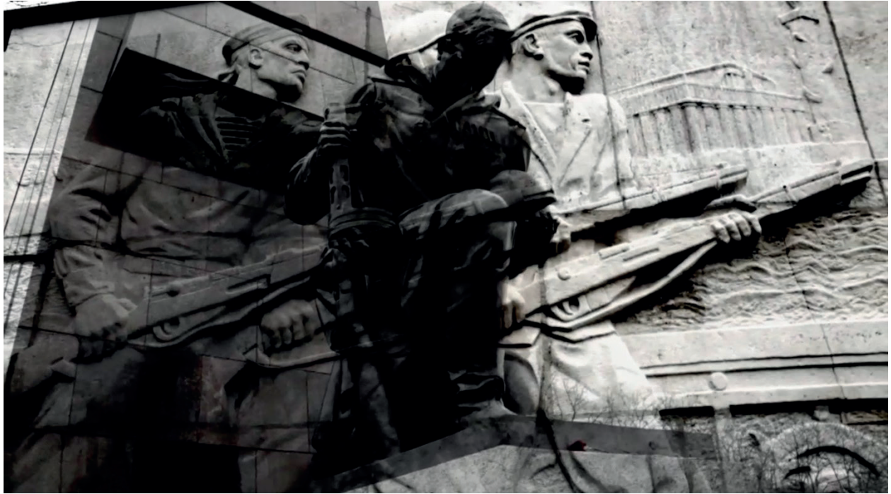
Figure 4 - Still frame from "Deus luta". Lucas Gervilla, 2015