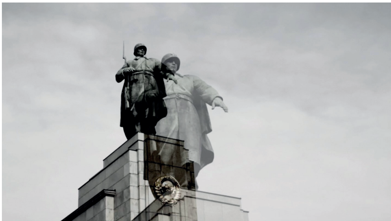
Figure 3 - Still frame from "Deus luta". Lucas Gervilla, 2015